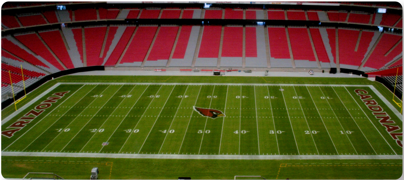
▲ Field over-seeded with Pangea GLR and Paragon GLR

Pangea GLR represents more than 40 years of perennial ryegrass breeding efforts to produce the one variety that performs anywhere and everywhere in the world!