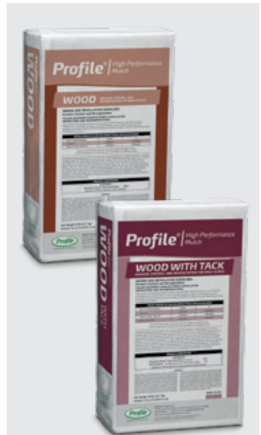
Made in Conover, North Carolina, USA