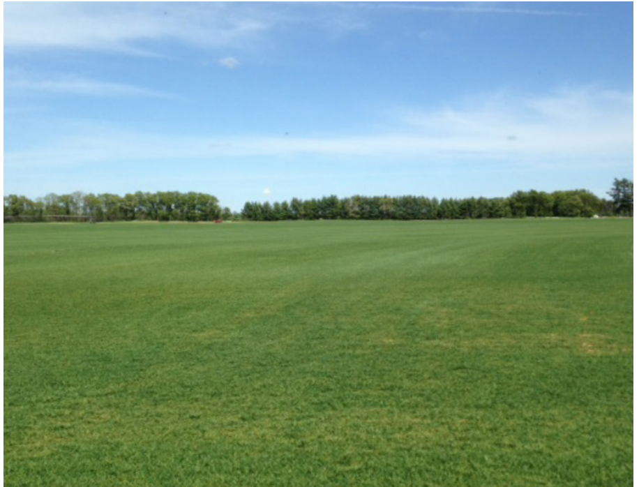
Everest in a Kentucky bluegrass sod blend